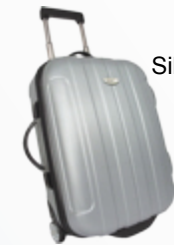
Hard Shell Silver Rolling Traveler's Case