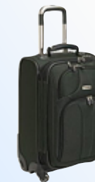
Rolling Nano-Tex® Carrying Case