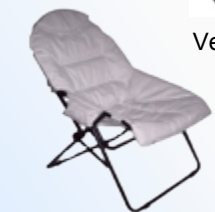
Foldable Treatment Chair